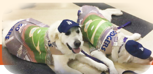
CSCP Dog Therapy Program